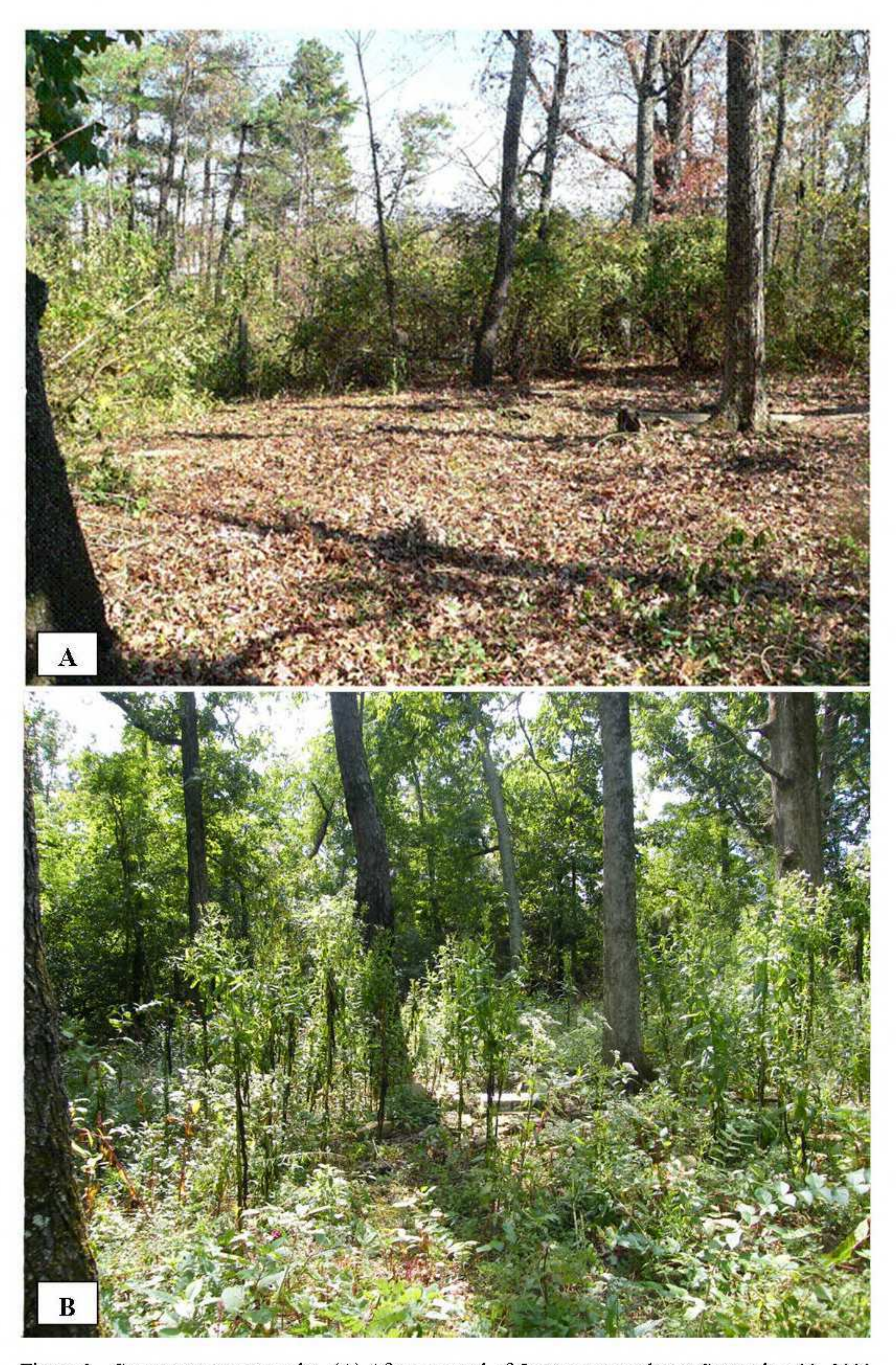
Figure 2. Cemetery test macroplot. (A) After removal of Lonicera maackii on September 10, 2010, and (B) secondary successional plant colonization on September 17, 2011.